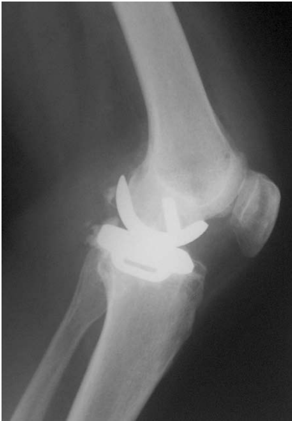
Figure 1: Lateral x-ray of unicompartmental knee arthroplasty with posterior cement extrusion.