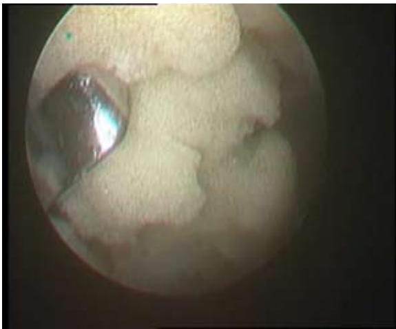
Figure 3: Cement fragment during arthroscopic removal after being broken off.

a switching stick was inserted through the anterolateral portal and was guided under direct vision between the ACL and the prosthesis to the posteromedial aspect of the knee. Subsequently, the arthroscope was advanced to the posteromedial compartment of the knee with the rail-road technique, in order to inspect it, safely establish a posteromedial portal and introduce a working cannula. Direct visualisation and detailed evaluation of the size and