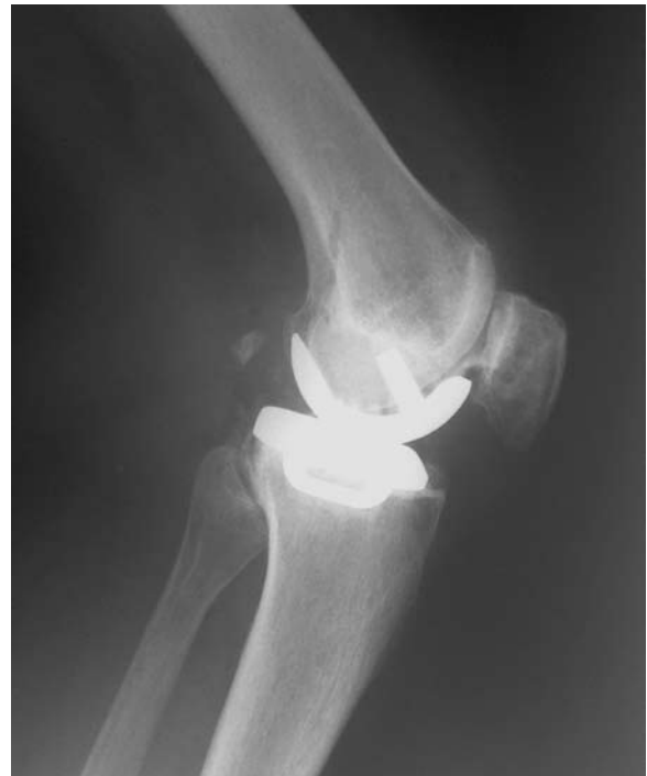
Figure 4: Lateral x-rays of unicompartmental knee arthroplasty following cement removal.

exact location of the cement extrusion was achieved with the arthroscope in the posteromedial portal. A sizeable cement piece, firmly fixed to the infero-postero-lateral aspect of the tibial component and extending laterally to the posterior septum was clearly seen (Figure 2). Despite its size it was barely seen with the arthroscope in the an-